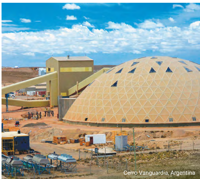
Cerro Vanguardia, Argentina

Cerro Vanguardia’s gold production was 175,000oz at a total cash cost* of $1,073/oz in 2024, compared to 164,000oz at a total cash cost* of $1,045/oz in 2023. Gold production increased by 7% year-on-year in 2024 compared to 2023, mainly driven by improved feed grades and better heap leach performance. Total cash cost per ounce* increased by 3% year-on-year in 2024 compared to 2023, primarily due to cost increases related to wages, materials, and services. The weakening of the Argentinian peso against the US dollar partially offset this increase. Additional cost pressures came from higher royalties, reflecting increased gold sales and prices and greater consumption of materials and services due to higher mining activity. The cost increase was also mitigated by higher by-product revenue from improved silver prices ($28/oz in 2024 vs. $23/oz in 2023).