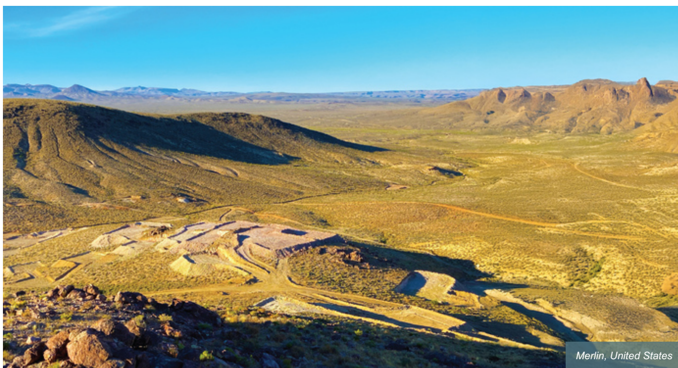
Merlin, United States

In Argentina, at Cerro Vanguardia, gold production was 47,000oz at a total cash cost* of $1,201/oz during Q1 2025, compared to 42,000oz at a total cash cost* of $902/oz in Q1 2024. Gold production increased by 12% year-on-year in Q1 2025 compared to Q1 2024, mainly driven by improved plant performance and higher head grade. Total cash cost per ounce* increased by 33% year-on-year in Q1 2025 compared to Q1 2024, mainly driven by higher materials and labour costs, and increased royalties, partially offset by a weaker Argentinian peso against the US dollar.