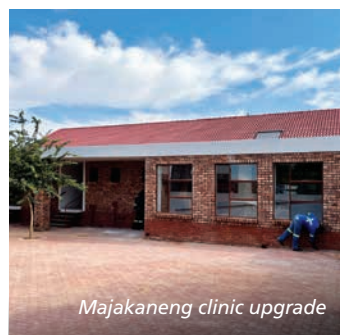
Majakaneng clinic upgrade