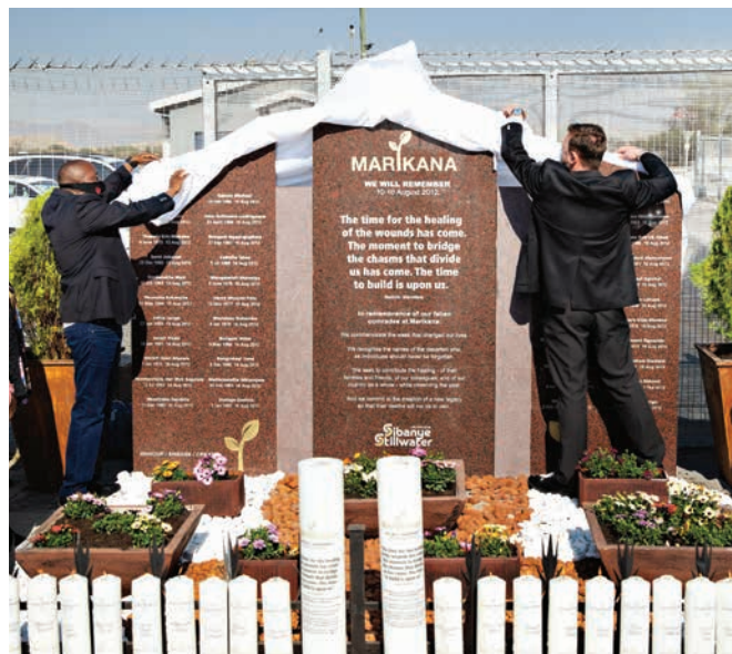
A wall of remembrance bearing the names of the deceased was erected at the Marikana operation to honour their legacy and ensure we never forget the Marikana tragedy of August 2012